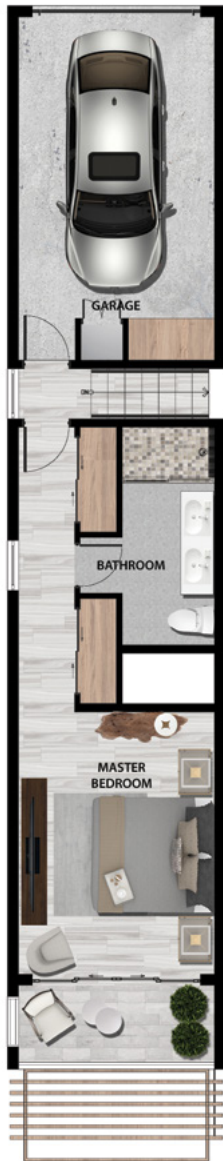
◆ Upper Floor