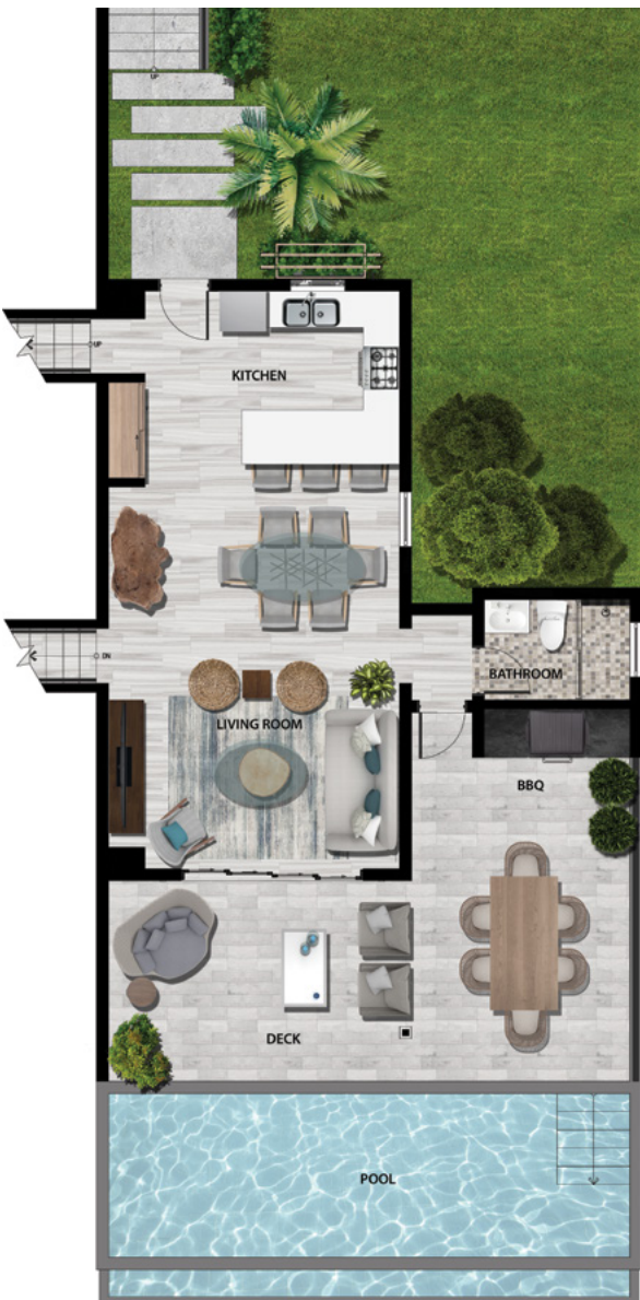
◆ Ground Floor