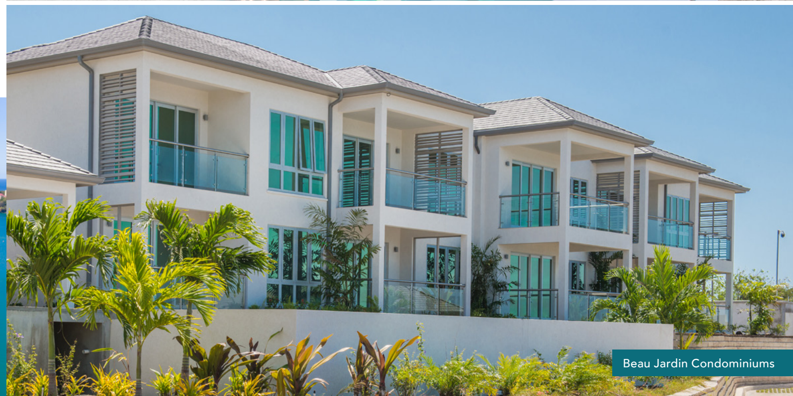
Beau Jardin Condominiums